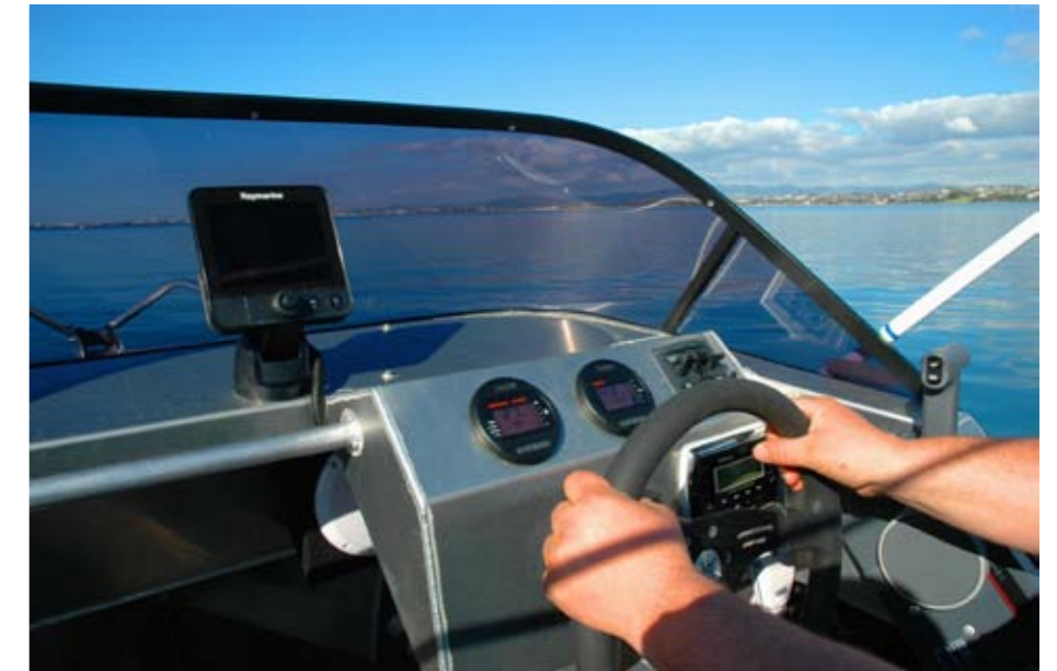
The fascia is plenty big enough for the usual engine monitoring instruments.