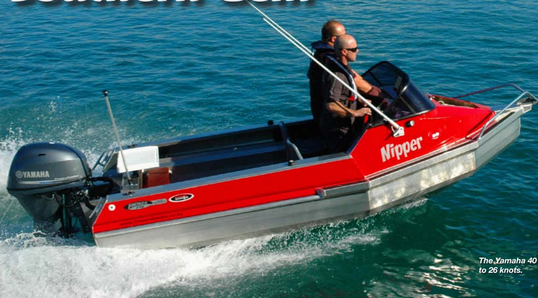
The Yamaha 40 pushes the F14 to 26 knots.